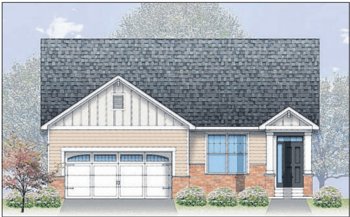
For those seeking single-level living, the Marigold ranch floor plan is available at the Enclave at Mill Creek.

Visitors can tour both decorated models from 10 a.m. to 5 p.m. daily. For directions or to preview floor plans at The Enclave at Mill Creek, visit www.MeritusHomebuilders.com . Or call (224) 634-4034.