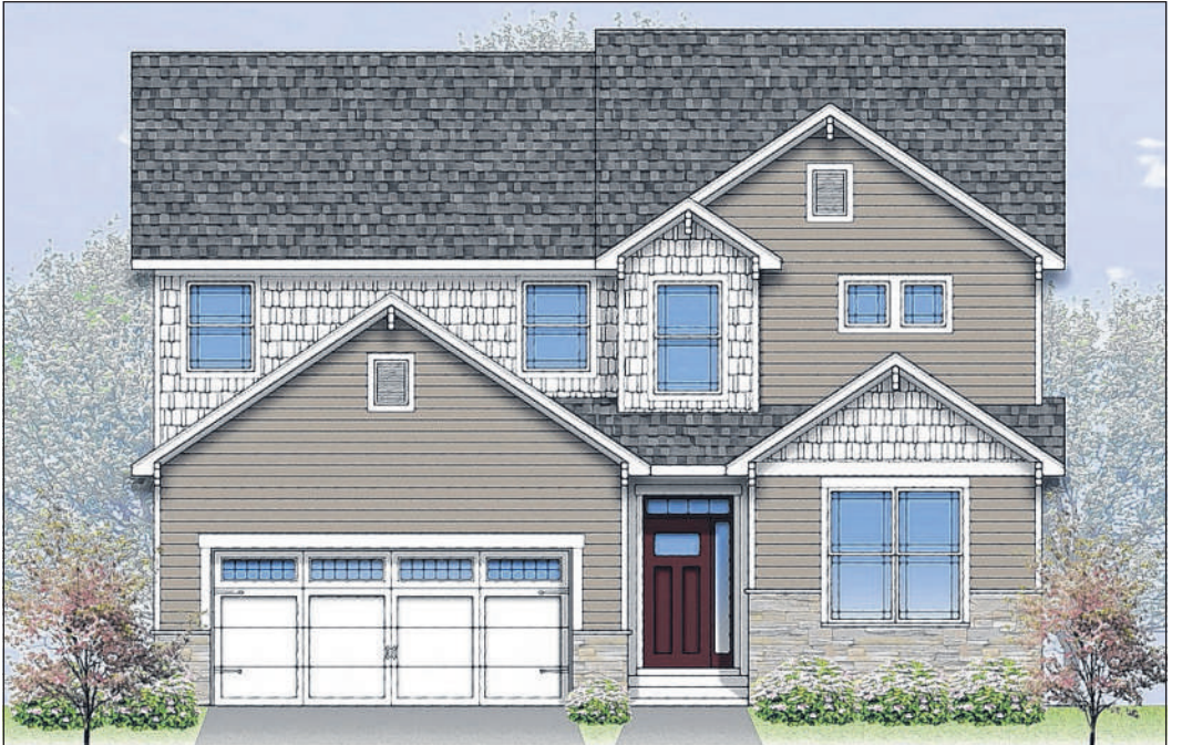
ILLUSTRATIONS COURTESY OF MERITUS HOMES The two-story Waterleaf floor plan is one of two new model homes being opened this weekend at the Enclave at Mill Creek in Addison.

Kitchens are designed around the chef with a full suite of stainless steel appliances including a range,